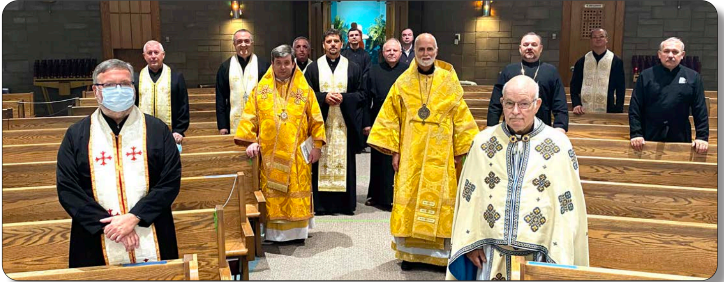
Ukrainian Catholic Archeparchy of Philadelphia Clergy Retreat in Long Branch, New Jersey on September 21st to 24th

In our bewildered, pandemic, pre-election world, we look for words of inspiration, encouragement, and guidance. There are no better ones than those of Sacred Scripture.