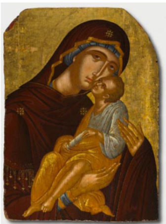
INSTITUTE LAUNCHES FALL WEBINAR SERIES ON "EASTERN CATHOLIC THEOLOGY IN ACTION"

Eastern Catholic Theology in Action will have a webinar series that will be held on Thursdays, beginning September 3, 2020. The courses are free and more information is available by clicking on the link below.